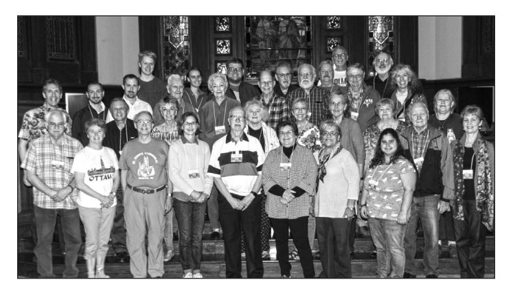
Our final activity was a delicious lunch, provided by two Central Christian friends of the carillon, cooked in the church kitchen and served to us in the auditorium. It was a final chance for good conversation—and food—before we parted ways.

The 2020 Texas Regional is scheduled to be held by the UT Carillon Guild at The University of Texas at Austin, date TBD.