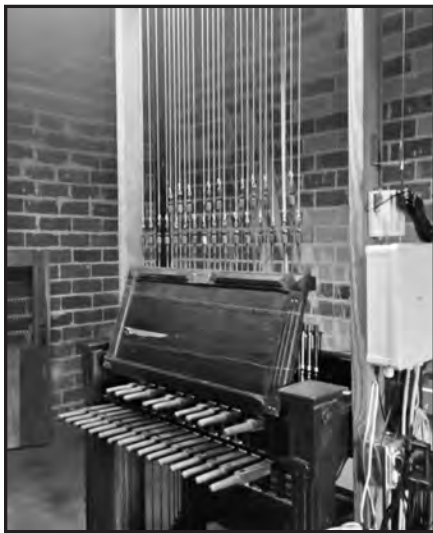
The Trinity console

As of this writing, the location for the 24th Texas Regional is still up in the air. Ideas have been tossed around for either Corpus Christi or San Antonio, so be sure to keep an eye on your email inboxes in the coming months.