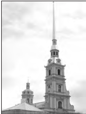
The Peter and Paul Cathedral in St. Petersburg