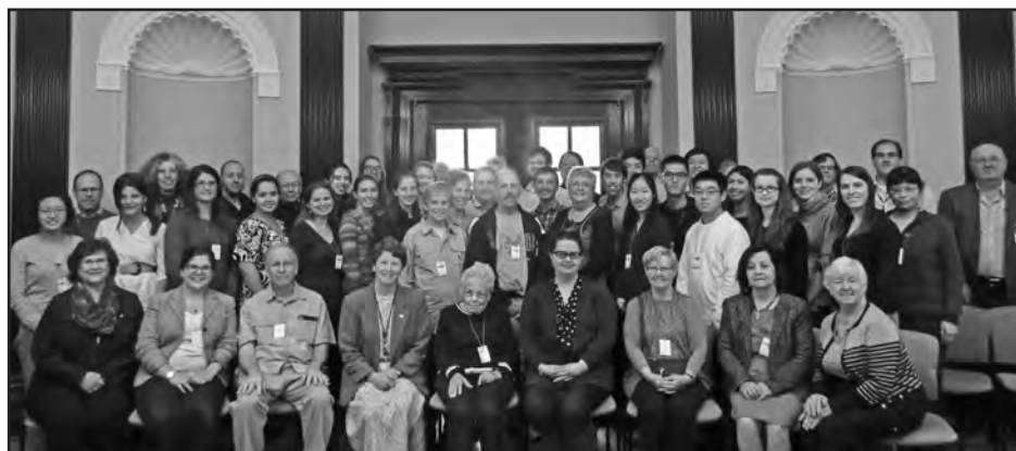
2015 Price Symposium attendees