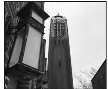
The carillon tower of First-Plymouth, with sculptures of the Evangelists