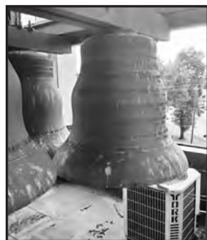
Three large major third bells, showing their distinctive bulge around the middle

After the open tower time was over, we all jumped in cars and headed to St. John the Divine Episcopal Church for the opening