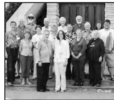
2015 Texas Regional Carillon Conference attendees