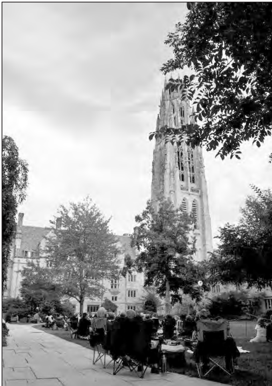
A carillon concert at Harkness Tower

The above is just a sample of what's in store. Don't miss this opportunity to celebrate the carillon, hear from so many composers, bring home lots of new music, and experience more surprises. Yale Guild is so excited to welcome you all, and we can't wait to see you soon.