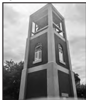
The Bell Tower Center instrument