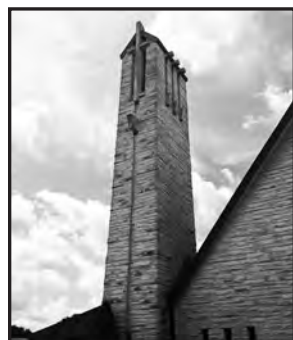
St. John the Divine

After the open tower time was over, we all jumped in cars and headed to St. John the Divine Episcopal Church for the opening