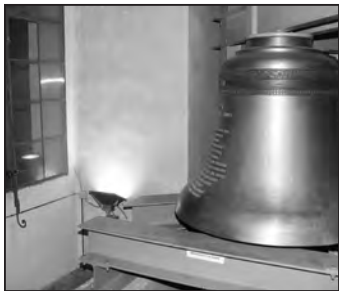
The B-flat bourdon of the carillon

The cathedral also houses Saint Petersburg's new carillon, whose 51 bells (from a low B-flat to a high D) were cast by Petit & Fritsen in 2000-2001 and installed in the latter year. The carillon was