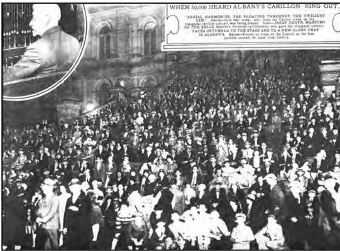
Crowd at the Albany carillon dedication

Perhaps we should include performances that are part of other events, though this is not something I feel that I can answer. This article consist of comments kindly sent to me. I do not propose that these comments are comprehensive, and omissions likely exist.