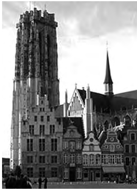
St. Rombout's Church carillon tower