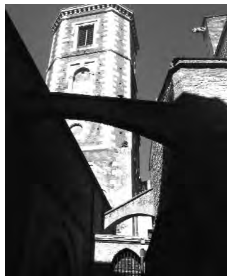
The Perpignan Carillon Tower with a nearby cathedral flying buttress