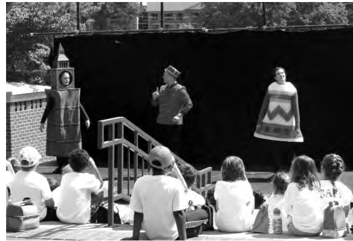
Billy the Bell, children's play

tantly, patrons should be recognized as individuals and feel important to the group.